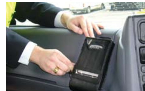
A customised case and charging solution was developed for the MPrint