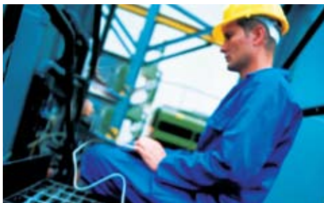
The MPrint range of mobile printers is stylish yet functional

Integrated wireless Bluetooth technology allows printing directly from a mobile device or PC without the need for cumbersome cables or the inconvenience of infra-red ports. This wireless freedom gives you many ways of using the printer, such as inside your jacket pocket or attached to your belt. The MW-145BT is the smaller of the two printers, producing A7 size prints, making it ideal for handheld use. Where more text needs to be printed, the MW-260 prints on A6 size paper.