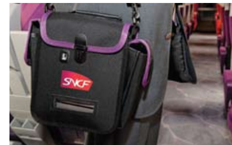
The MPrint can easily be incorporated into a custom made carrying case