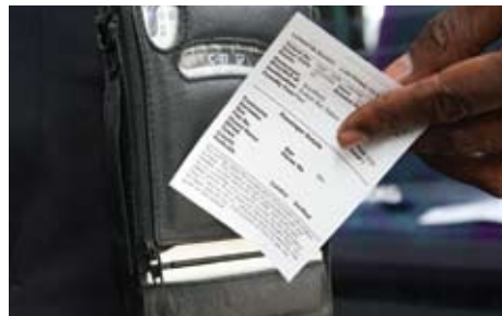
Small and compact enough to comfortably fit in the hand