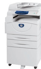
WorkCentre 5020DN shown with Duplex Automatic Document Feeder, optional Tray 2 and Stand

UL – 60950 – 1 / CSA – 60950 – 1 – 03, CE Mark applicable to Directives 2006 / 95 / EC, 2004 / 108 / EC, 1999 / 5 / EC